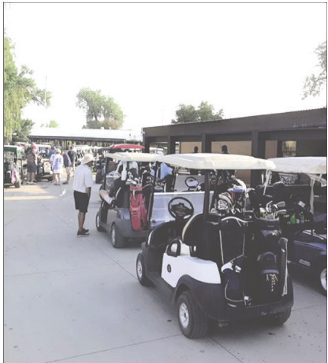
They were ready to roll for Labor Day tourney