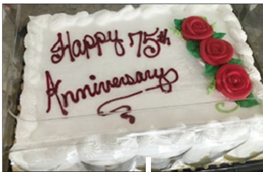
Please see story Page 2