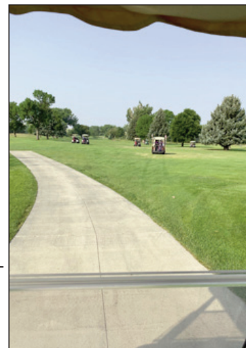
A windshield view of Derby activities