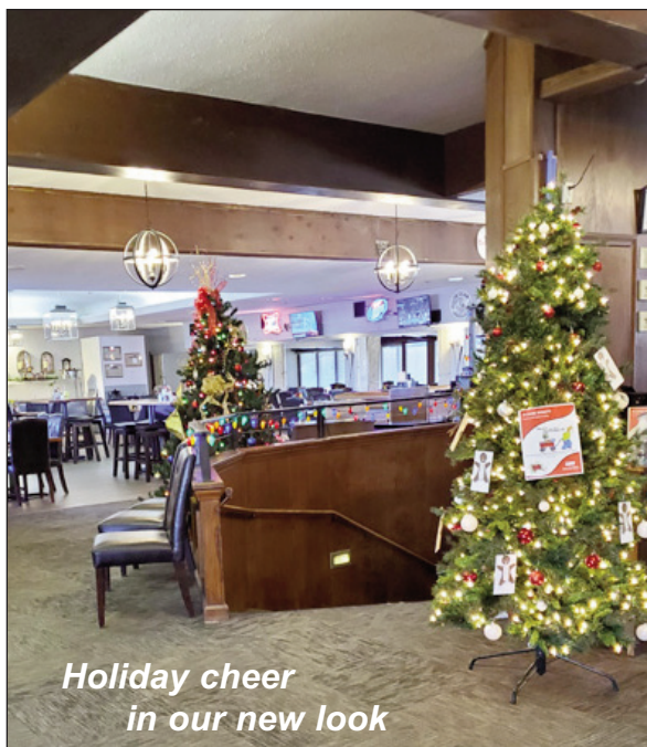
Holiday cheer in our new look