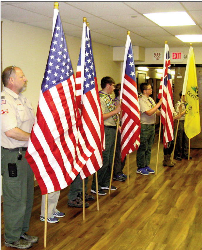
Boy Scout Troop 1187 presented historic colors